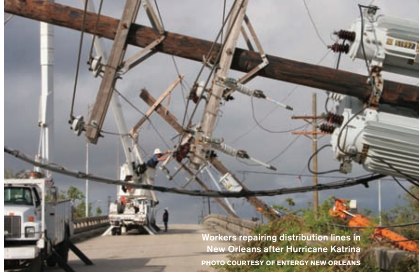
Workers repairing distribution lines in New Orleans after Hurricane Katrina

Entergy, Vince and City Council members also unsuccessfully lobbied Congress